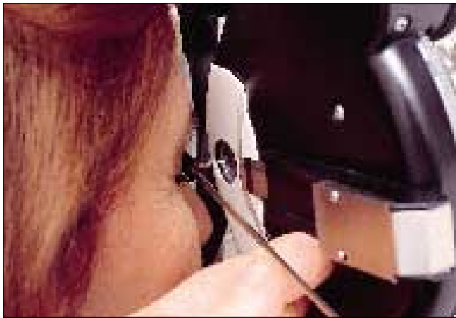
Figure 3. Weiss Vertexometer in place between patient and refractor.

was 20.4 mm. The true vertex range (eyelid thickness included) was 10 to 34 mm.